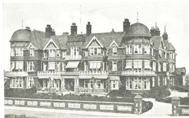
VIEW OF HOTEL