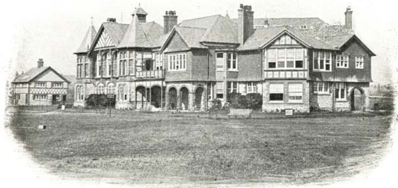
✧ GOLF CLUB HOUSE. ✧