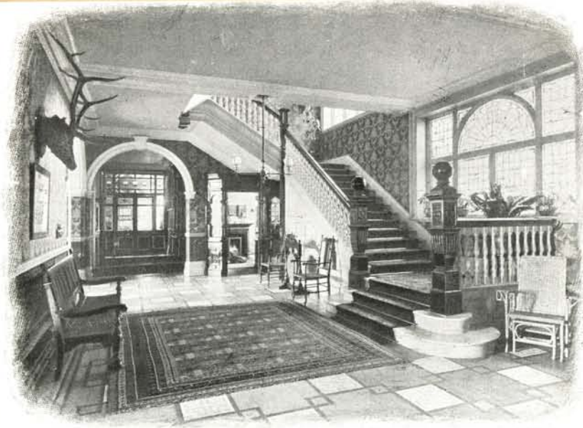
VIEW OF HALL.